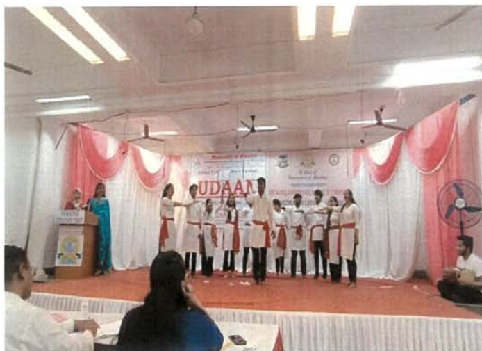
STUDENTS OF RJ COLLEGE WON THE SECOND PRIZE IN STREET PLAY