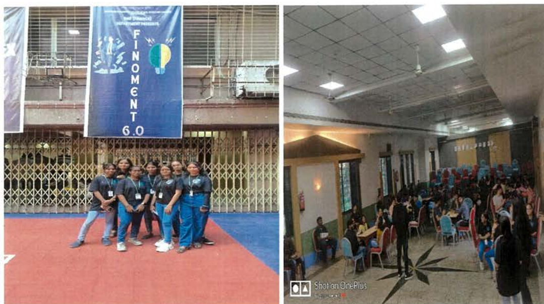
Students during the event participating in different activities