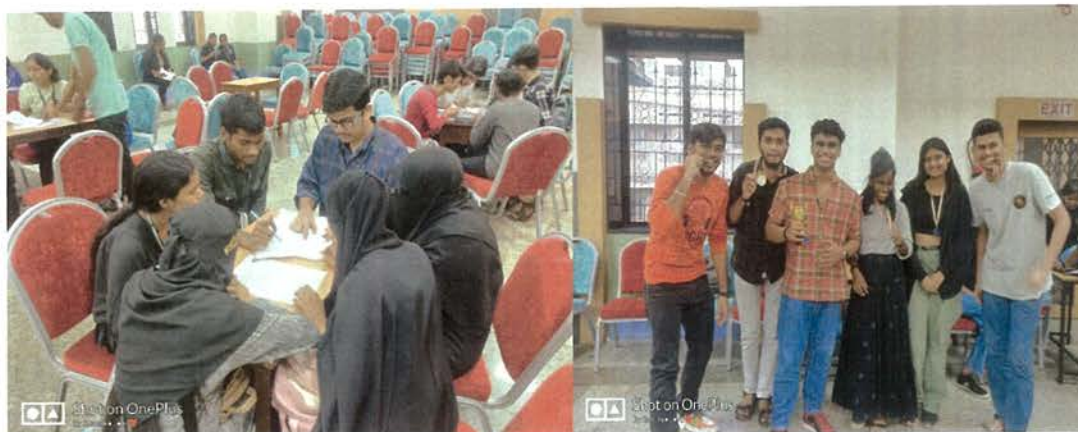
Students during the event participating in different activities