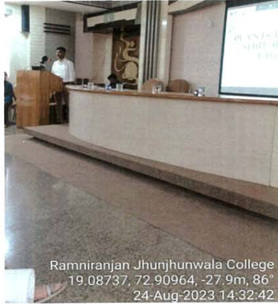
Ramniranjan Jhunjhunwala College 19.08737, 72.90964, -27.9m, 86° 24-Aug-2023 14:32:42