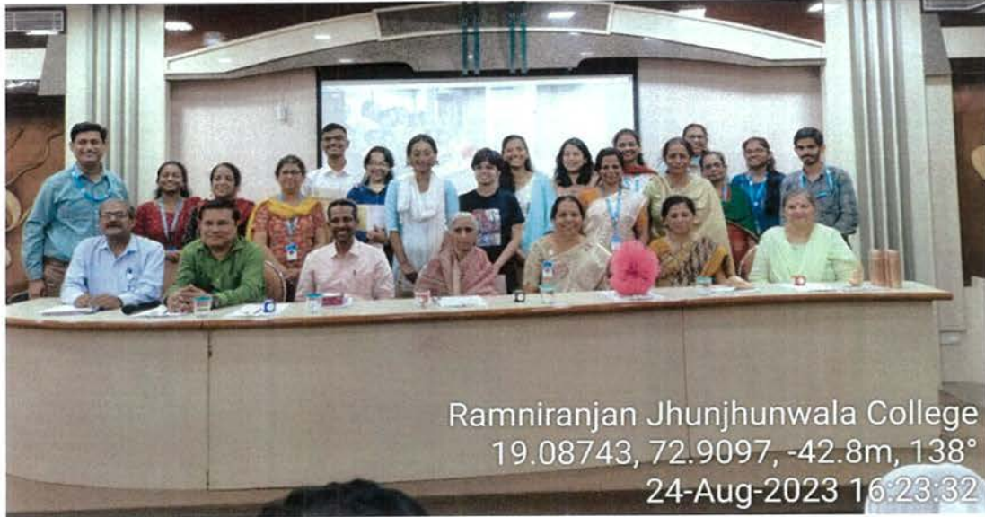
Ramniranjan Jhunjhunwala College 19.08743, 72.9097, -42.8m, 138° 24-Aug-2023 16:23:32