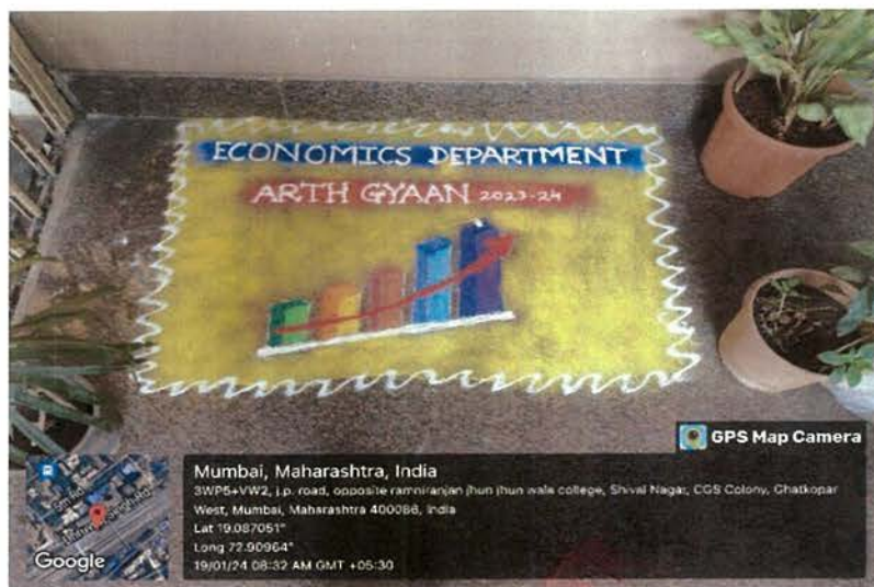
Rangoli displayed by students