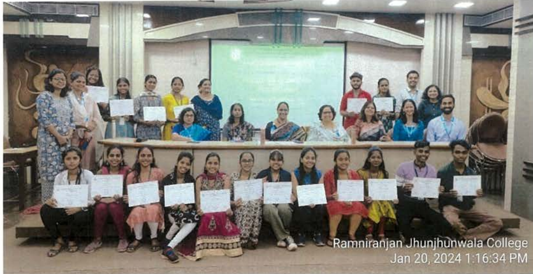
All participants of Poetry recitation Competition on Jan, 4, 2024

Affiliated to UNIVERSITY OF MUMBAI || NAAC Re-Accredited 'A' Grade (CGPA: 3.10)