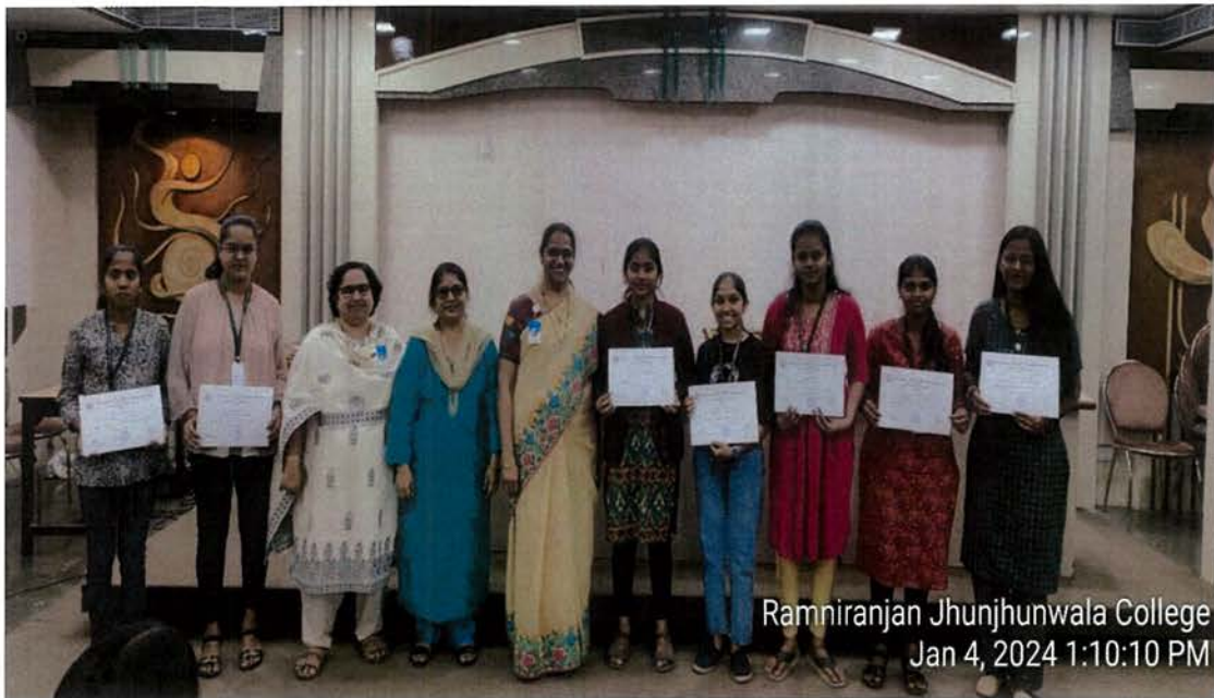
Ramniranjan Jhunjunwala College Jan 4, 2024 1:10:10 PM