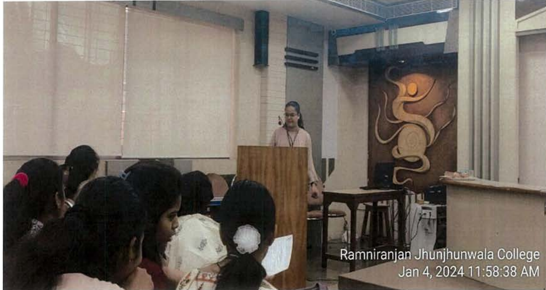
Ramniranjan Jhunjunwala College Jan 4, 2024 11:58:38 AM

Affiliated to UNIVERSITY OF MUMBAI || NAAC Re-Accredited 'A' Grade (CGPA: 3.10)