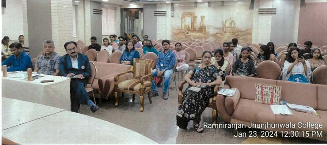
Judges, teachers and students' audience enjoying Late Shri. Jugaldas Damodar Modi Trophy Inter-collegiate Marathi Elocution Competition on January 23, 2024.

Affiliated to UNIVERSITY OF MUMBAI II NAAC Re-Accredited 'A' Grade (CGPA: 3.10)