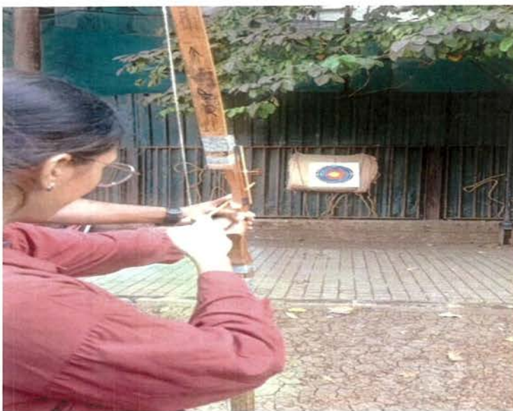
A participant aiming during the frenzy