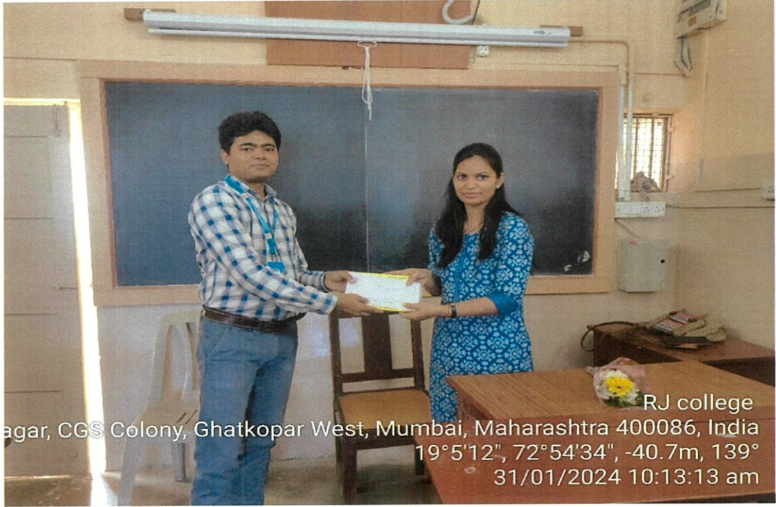
RJ college agar, CGS Colony, Ghatkopar West, Mumbai, Maharashtra 400086, India 19°5'12", 72°54'34", -40.7m, 139° 31/01/2024 10:13:13 am