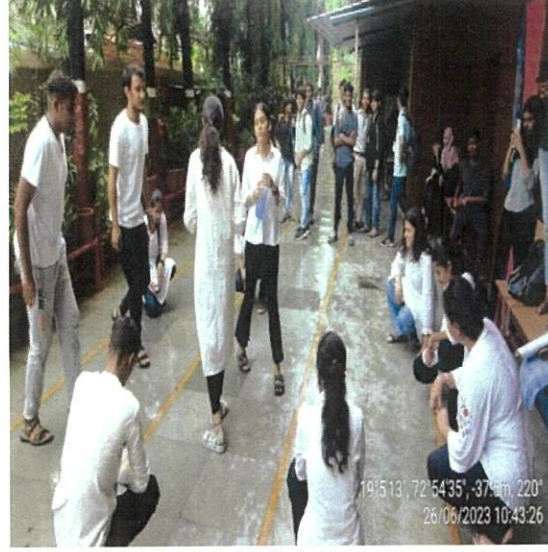
Students enacting the skit outside the Seminar Hall