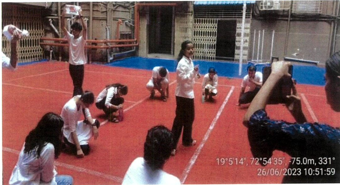
Students performing at the quadrangle