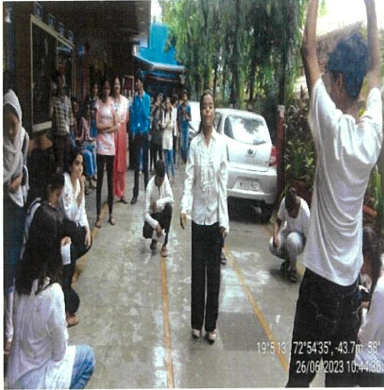
Photos of the Skit on Substance Abuse enacted on 26/06/2023

Affiliated to UNIVERSITY OF MUMBAI || NAAC Re-Accredited 'A' Grade (CGPA: 3.10)