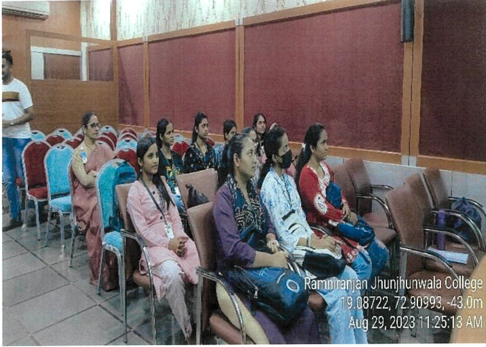
Students enjoying Special Session/ Guest lecture on 29/08/2023

Affiliated to UNIVERSITY OF MUMBAI || NAAC Re-Accredited 'A' Grade (CGPA: 3.10)