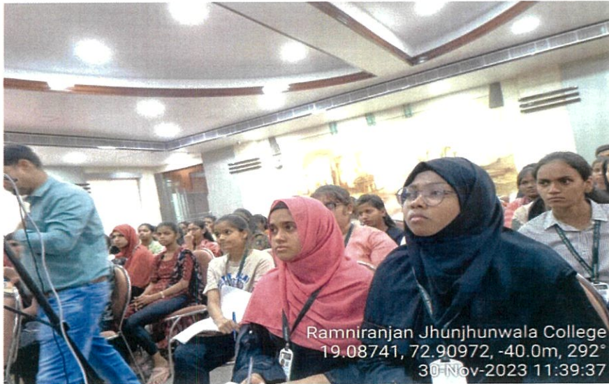
Student participants engrossed during the session