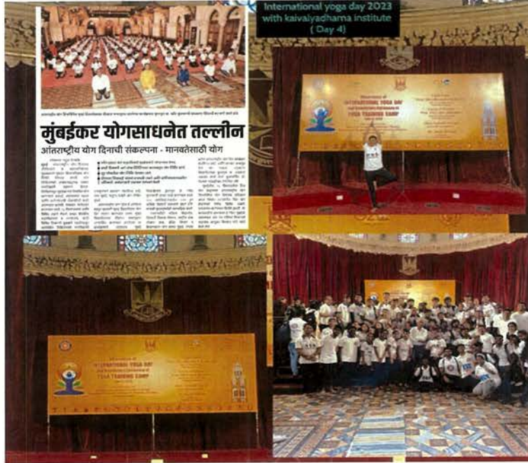
Students learning yoga training at Kaivalyadhama institute auditorium.

Affiliated to UNIVERSITY OF MUMBAI || NAAC Re-Accredited 'A' Grade (CGPA: 3.10)