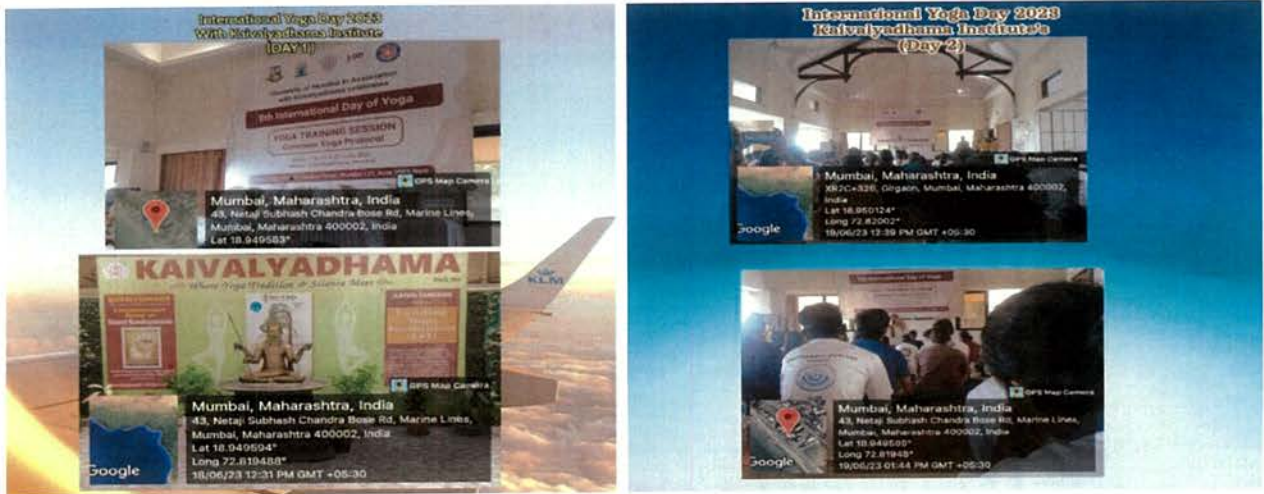
Volunteers attending a session on a yoga training programme.