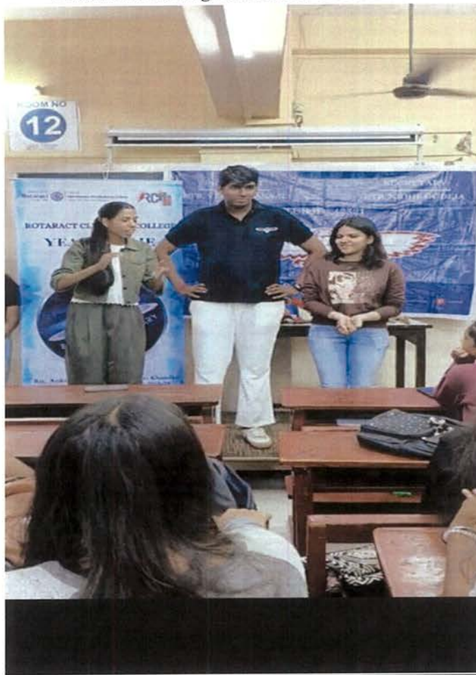
Participants interacting during Budding Bonds