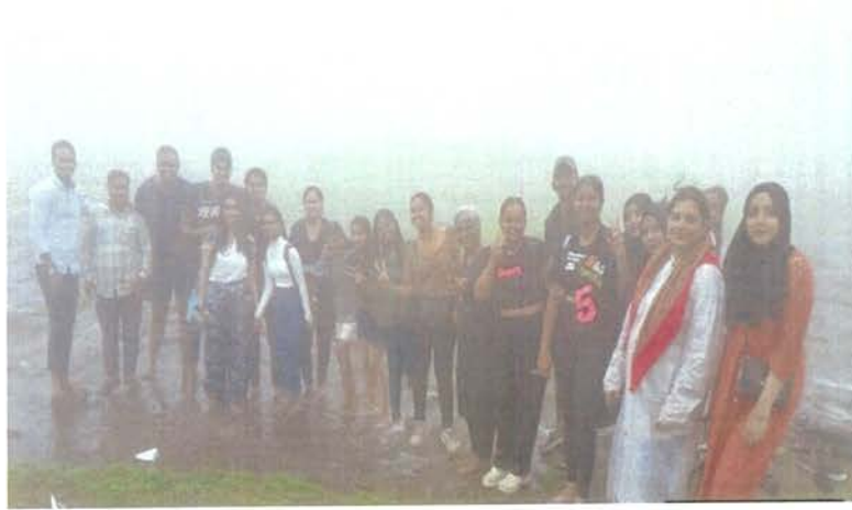
Students learning the importance of Environmental Ethics, July 18, 2023

Affiliated to UNIVERSITY OF MUMBAI || NAAC Re-Accredited 'A' Grade (CGPA: 3.10)