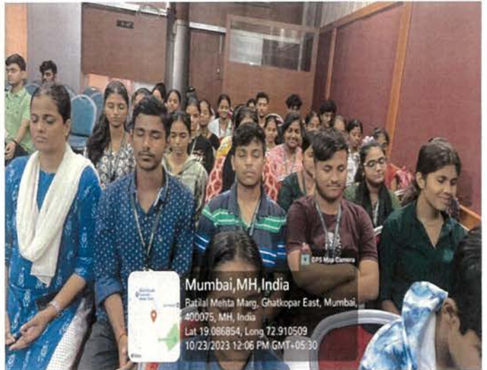
Students during the meditation session