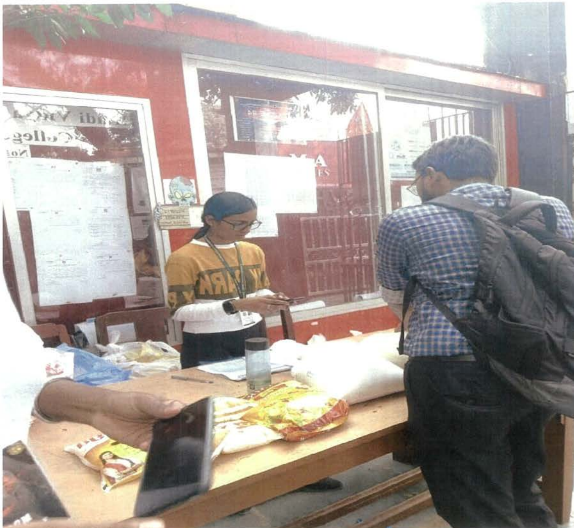
Photo of Helping Hands Event on 27 th January 2024

Affiliated to UNIVERSITY OF MUMBAI || NAAC Re-Accredited 'A' Grade (CGPA: 3.10)