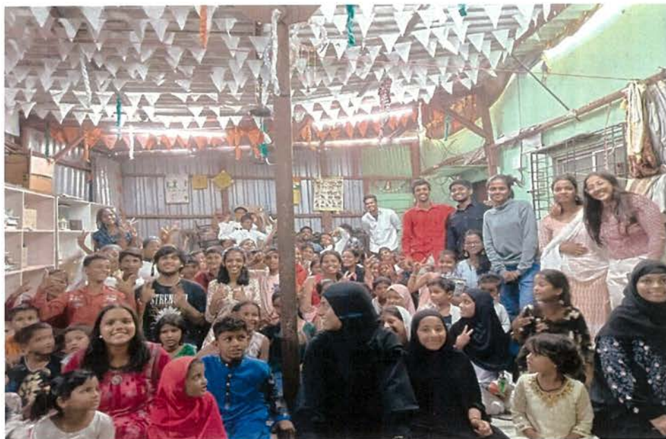
RCRJ Volunteers along with Enrich Lives Foundation celebrated Diwali with children