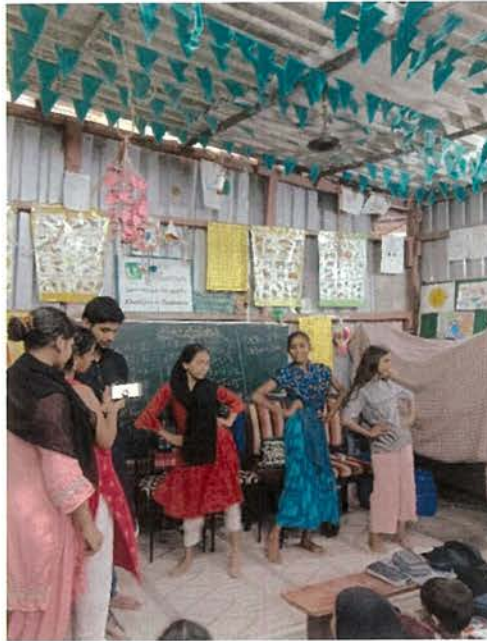
RCRJ volunteers celebrated Diwali with underprivileged children