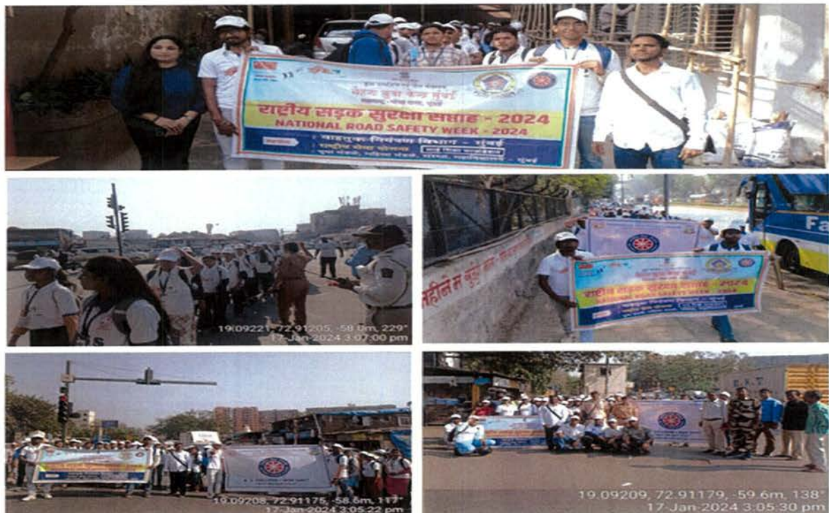
Volunteers participated in the rally and group photos of volunteers with officers and NGO members