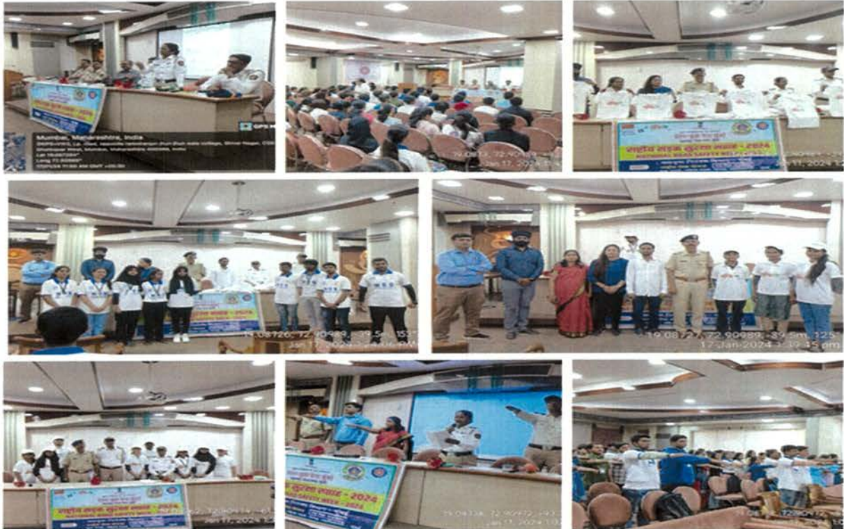
Session for volunteers on road safety awareness

Affiliated to UNIVERSITY OF MUMBAI || NAAC Re-Accredited 'A' Grade (CGPA: 3.10)