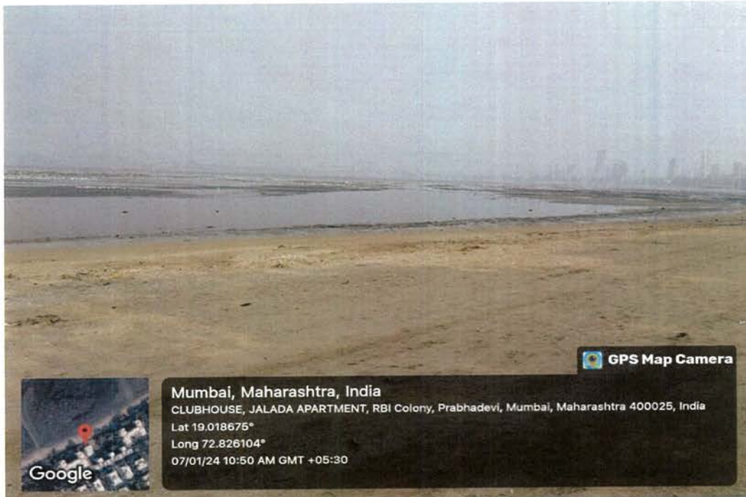
After Cleaning the Beach