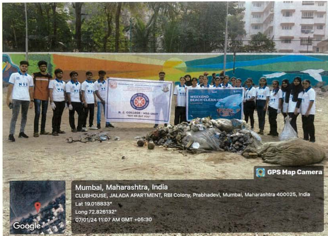
Volunteers cleaning the beach

Mumbai, Maharashtra, India CLUBHOUSE, JALADA APARTMENT, RBI Colony, Prabhadevi, Mumbai, Maharashtra 400025, India Lat 19.018765° Long 72.826037° 07/01/24 11:02 AM GMT +05:30