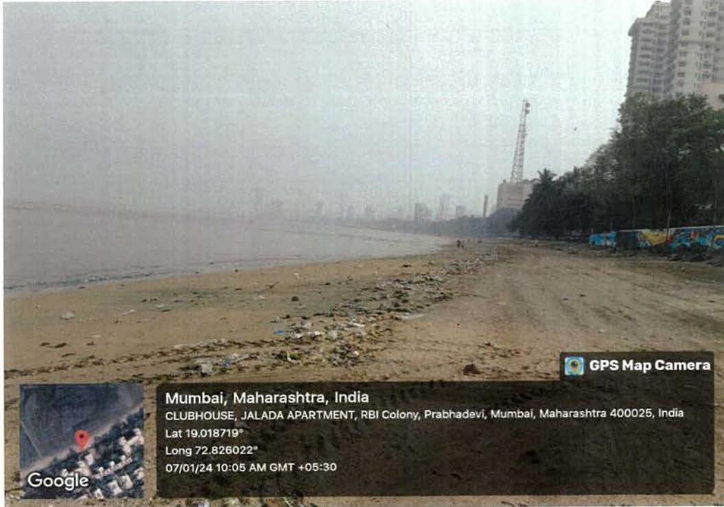
Before Cleaning the Beach