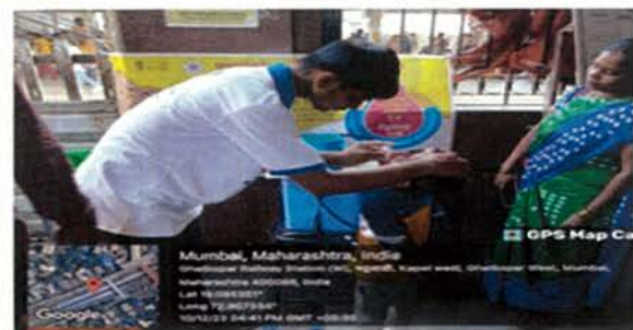
Pulse Polio Camp