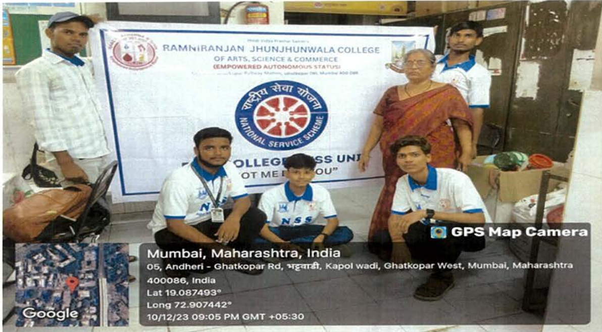
Polio camp at Ghatkopar station.

Photos of pulse polio camp in collaboration with Sarvodaya municipal health post 10 th December 2023