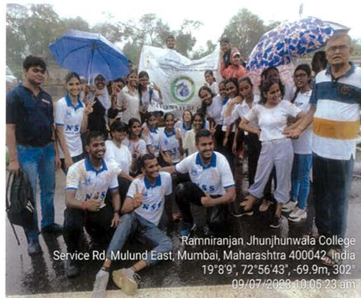
RJC NSS Volunteers during the tree plantation drive at the Eastern Highway Nahur

Ramniranjan Jhunjunwala College Service Rd, Mulund East, Mumbai, Maharashtra 400042, India 19°8'9", 72°56'43", -69.9m, 302° 09/07/2023 10:05:23 am