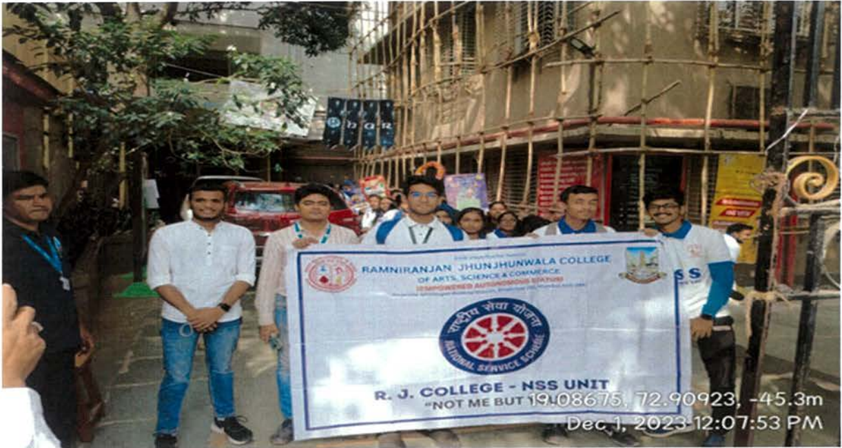
Volunteers gathered to start the rally.