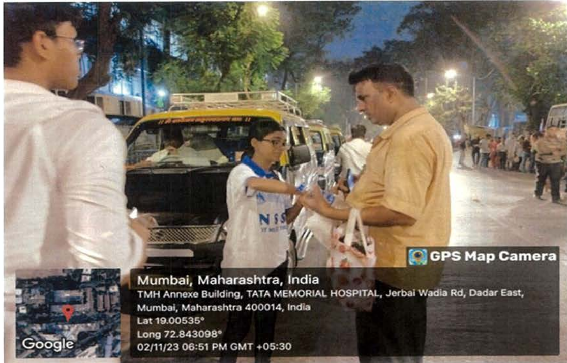
Volunteers and foundation papeles are distribute a Food