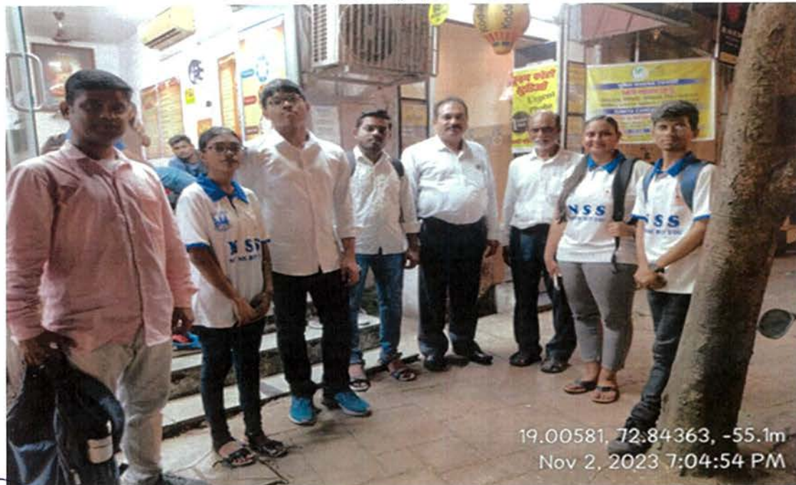
Volunteer after end the Food distribution take a group photo with Satya Sai Seva Foundation