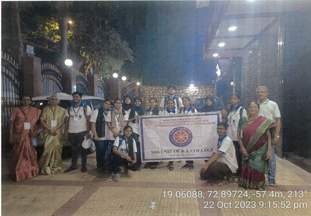
Our Volunteers in Group Photo with Vasantha Memorial Trust Members.