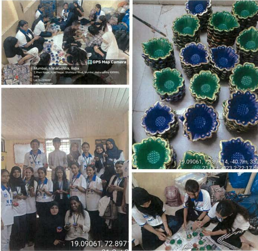
RJC NSS Volunteers painting diya for the celebration of Diwali