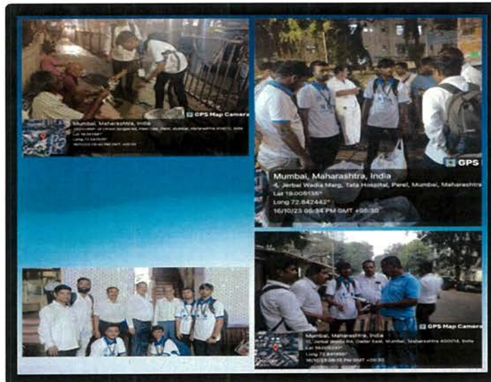
NSS Volunteers in collaboration with Satya Sai Seva Foundation