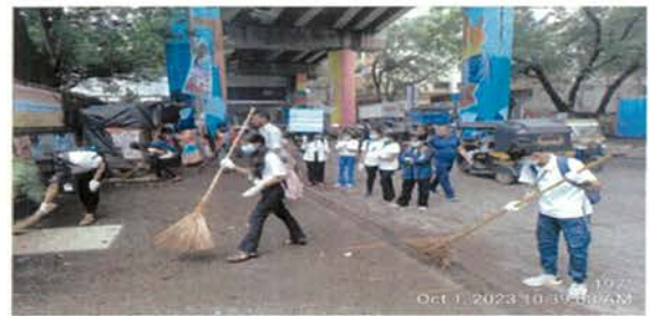
NSS volunteers under took the clean-up drive with BMC and school students