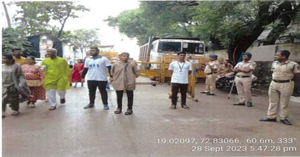
RJC NSS volunteers controlling traffic with traffic officers