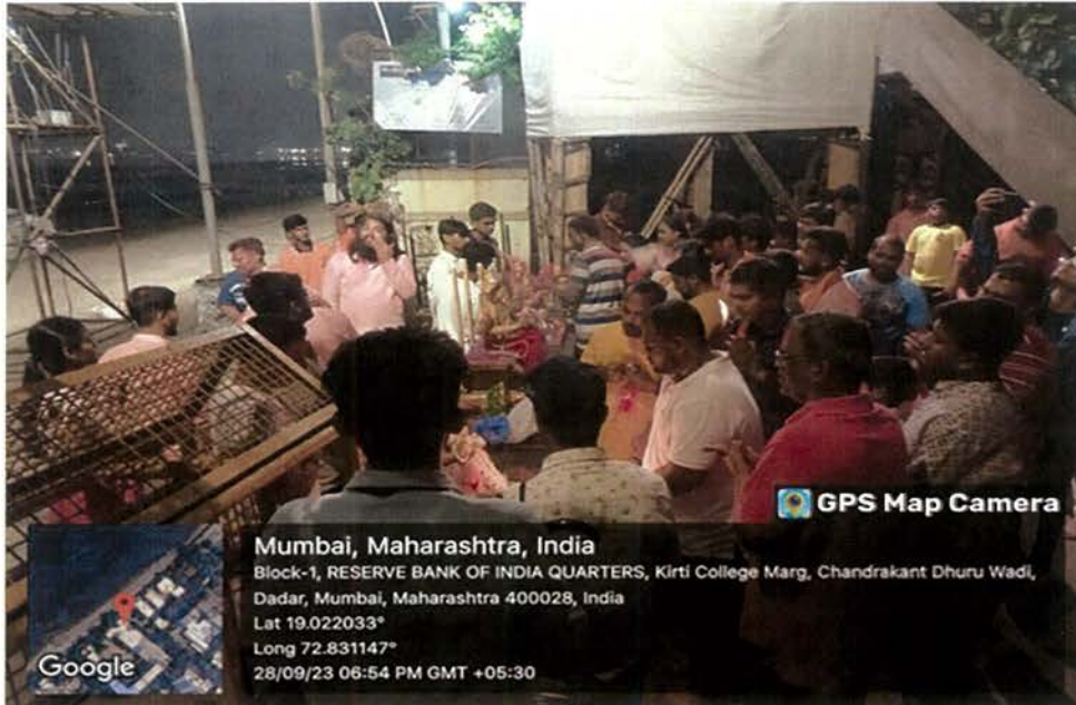
Volunteer managing the people's with traffic officers

Affiliated to UNIVERSITY OF MUMBAI || NAAC Re-Accredited 'A' Grade (CGPA: 3.10)