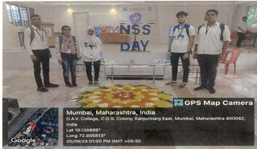
Volunteers celebrating one day mela in R.A.D.A.V. College