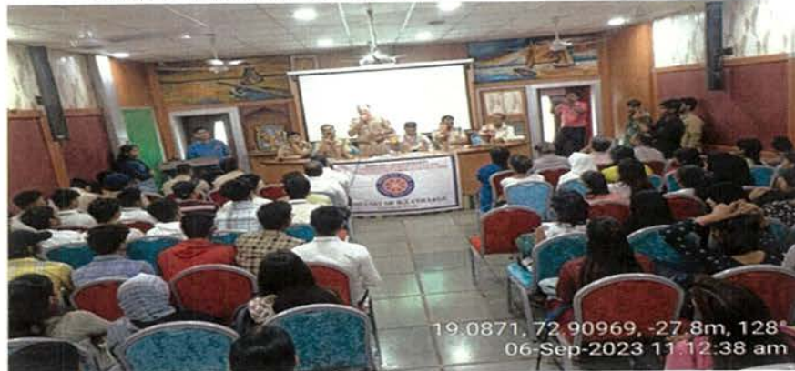
Volunteers taking a session of Railway Safety Programme