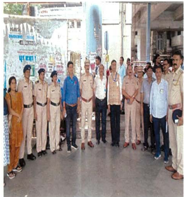
Volunteers take awareness rally for the Railway Safety Programme