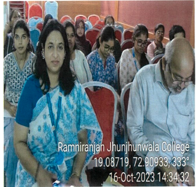
Student and teacher participants during the workshop