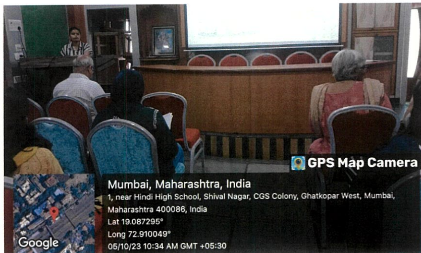
A Participant presenting her research topic