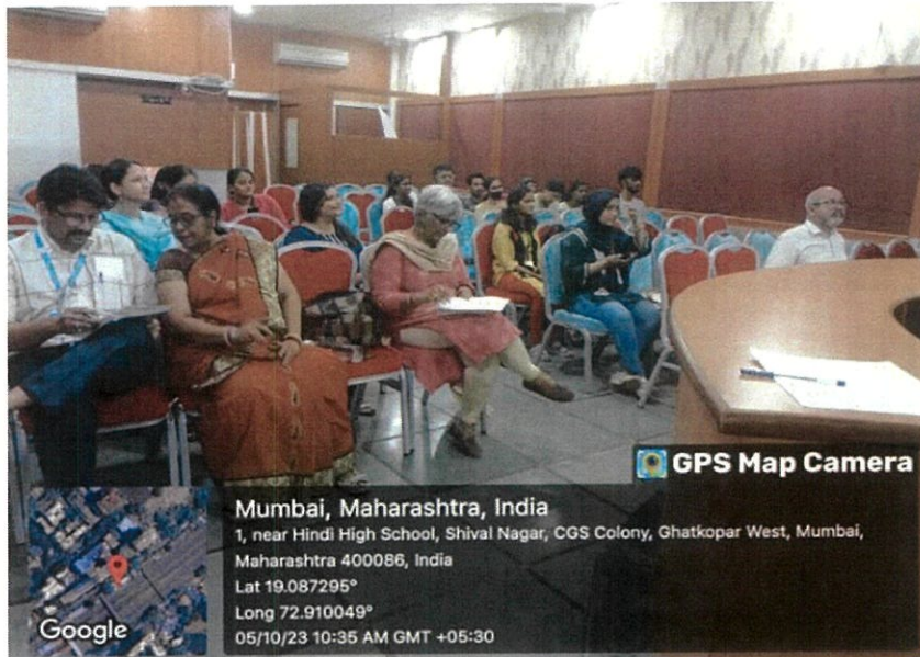
Judges and Participants during the competition