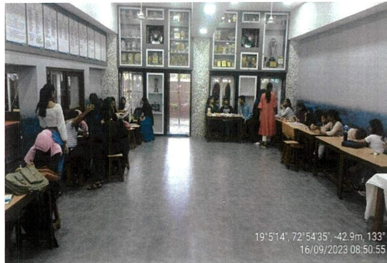
Stalls set up by students during HUNAR 2.0