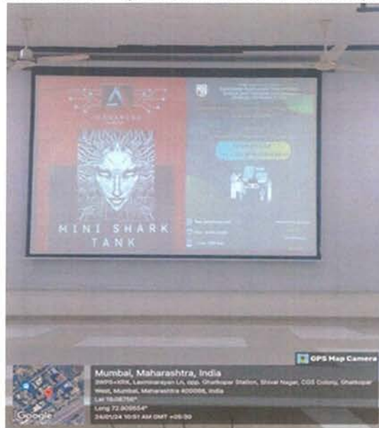
PPT Presentation of a student participant