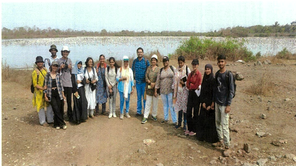
Students during the Field Visit at T.S. Chanakya (Palm beach road, Navi Mumbai).